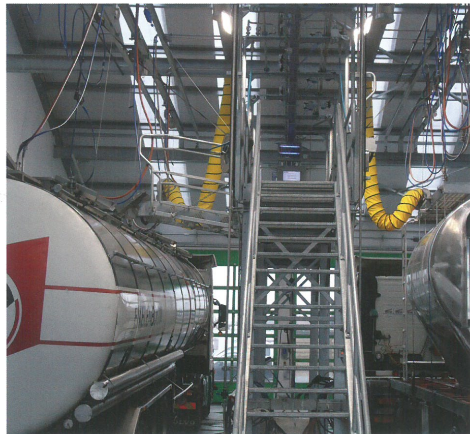
Eikelenboom's new food tank cleaning station

CTW has installed a new CIP/latex cleaning unit for Cotac Belgium, a member of the Hoyer Group. This custom-built unit is developed for the use of three washing heads on two washing lanes. The CTW latex unit consists of a buffer tank with steam heating, a feeding pump, washing heads, a membrane pump, a filter, and flow measurement devices. This unit is available in several sizes and executions, depending on the needs of the customer.