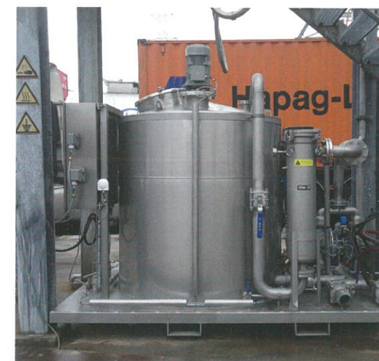
Cotac's new CTW latex cleaning unit